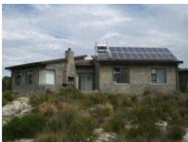
Off-grid installations have been done all over Africa using MLT's excellent inverters and panels

Stock inverters are transported from the MLT factory and warehouse in South Africa all over the world. GreenSparks founder – Neil Bradshaw - watches over the packing process as the inverter weighs several tonnes and represents a significant investment.