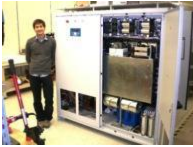
USA - the first prototype GPI inverter

Designer and builder, standing proud, next to the first prototype 200kVA inverter. In the second quarter of 2012 this inverter was relocated to and commissioned in California.