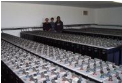
Lucingweni - rural electrification battery room

Designer and builder, standing proud, next to the first prototype 200kVA inverter. In the second quarter of 2012 this inverter was relocated to and commissioned in California.