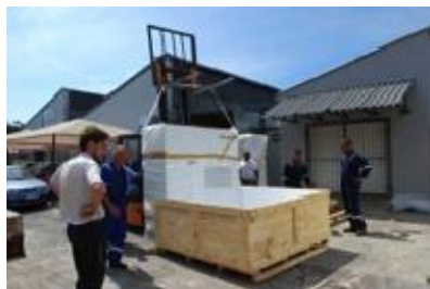
GPI 480-201 250kVA inverters being packed to fly to Montana, USA