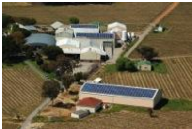
140kW grid-tied solar inverter system – Villiera Winery, Cape Town

Large battery rooms are constructed to protect batteries from the elements and in large installations to prevent people from being killed by high voltages. With large battery installations comes large voltages and like any mains power supply this is potentially dangerous. Huge battery rooms that run the likes of factories, entire villages, hospitals and hotels can have voltages up to 480V. These rooms must be designed by experienced solar engineers like GreenSparks.